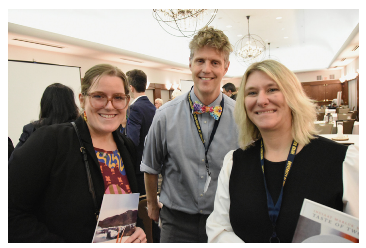
NENA Spring Conference 2024: Students & Faculty at The Regency Hotel in Portland