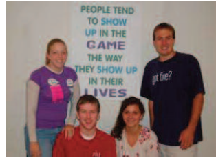
UMF students prepare for the GEAR UP orientation day.

FARMINGTON – The UMF Partnerships for Success GEAR UP program recently held orientation for 40 UMF students who will be working this year with 420 middle and high school students in Jay, Dixfield, and Rumford.