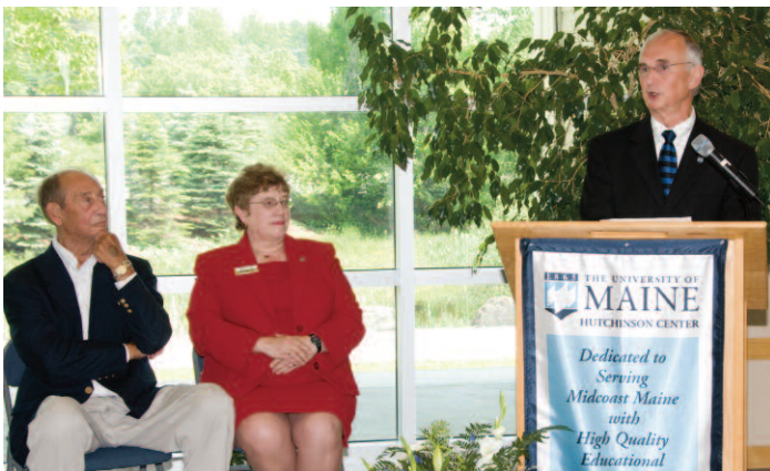
President Kennedy addresses participants at the ribbon-cutting ceremony.

A monthly sampler of educational, cultural, and economic contributions of Maine's public universities