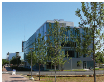
USM's new Wishcamper Center